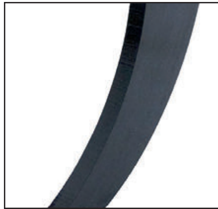
1 ¼" wide Shanks