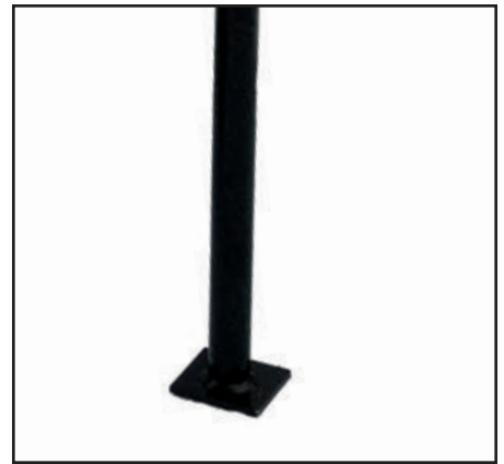
Parking Stands are Standard