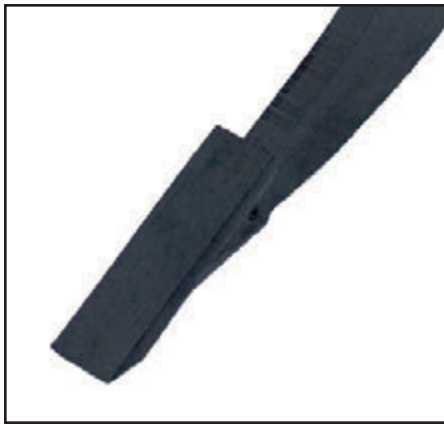
Replaceable Heat-Treated Cutting Tip