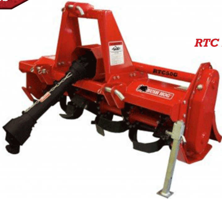
RTC Series Compact Rotary Tillers

One year machine limited warranty with a 5 year limited warranty on the center and side gearboxes (years 3-5, parts only).