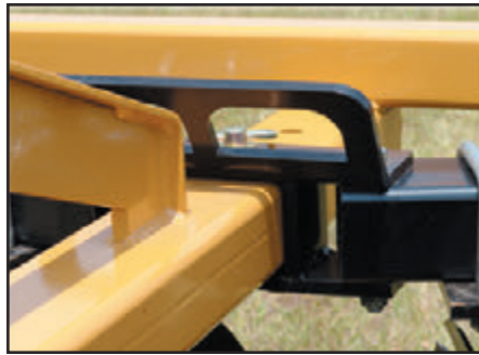
Easy-to-grasp handle for simple gang adjustment