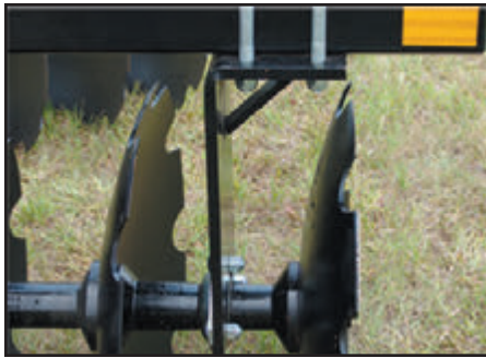
Bearing hangers reinforced with gussets