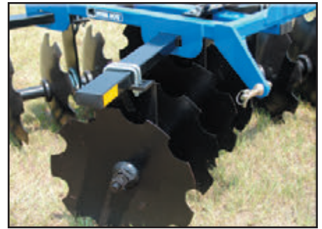
Notched discs for maximum cutting action